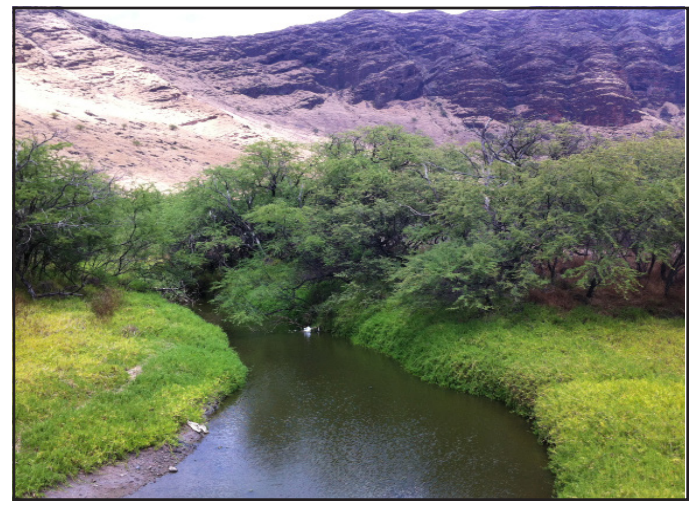
View of West Mākaha Stream from Farrington Highway