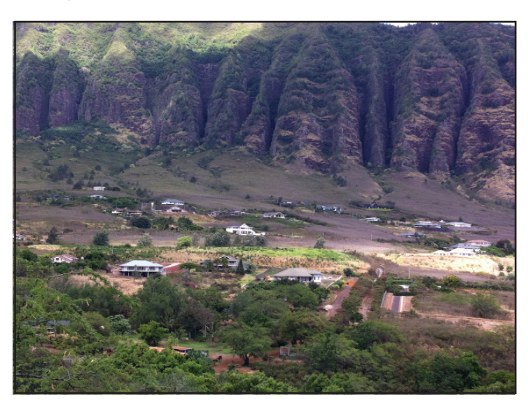
Mauna 'Olu Estates subdivision located at the base of steep valley walls

Under the Land and Natural Resources Prevention of Natural Disasters (LNR 810), the DLNR has authority to render technical assistance on floodplain management activities within the State.