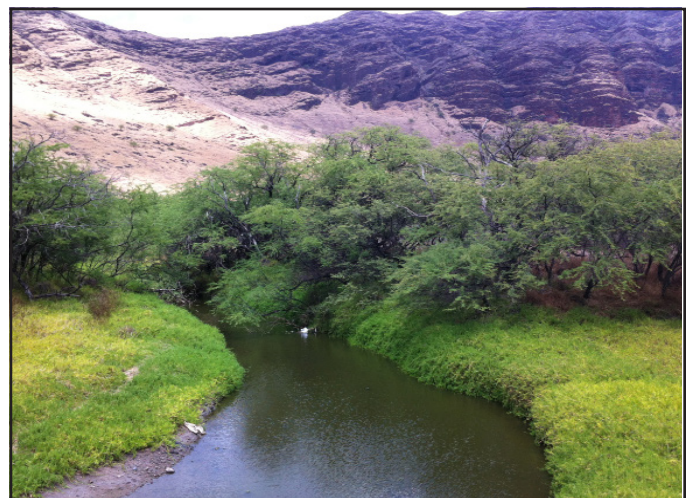
View of West Mākaha Stream from Farrington Highway