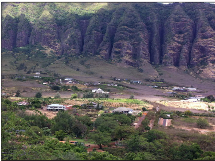
Mauna 'Olu Estates subdivision located at the base of steep valley walls

Under the Land and Natural Resources Prevention of Natural Disasters (LNR 810), the DLNR has authority to render technical assistance on floodplain management activities within the State.